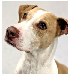
Leo 6 years old

This gorgeous calico loves to curl up in any soft spot she can find. Harbor is an independent gal who, when the mood strikes, will purr with delight if you scratch under her chin.