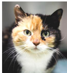
Harbor 3 years old

This gorgeous calico loves to curl up in any soft spot she can find. Harbor is an independent gal who, when the mood strikes, will purr with delight if you scratch under her chin.