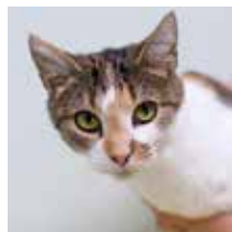
Elvira EBOD 04/16/16

Initially very shy, Elvira has become more outgoing. She gets along with other cats and quickly warms up to new people.