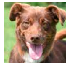
Impala EDOB 07/18/16

Initially very shy, Elvira has become more outgoing. She gets along with other cats and quickly warms up to new people.