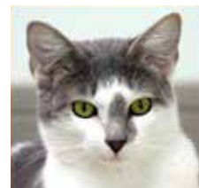
Arbee EBOD 5/2016

Nala is a playful, energetic doberman/boxer mix who gets along great with other dogs and wants a home with room to romp and run.