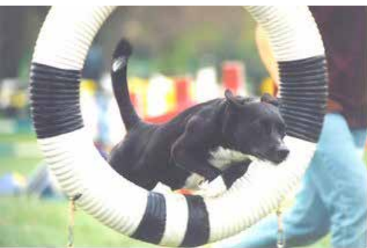
Tippy was a National Dog Agility Champion

Our pets are our family. We have been so fortunate to have them and share an amazing journey with them!